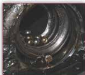
Catastrophic engine failure caused by IMS bearing failure