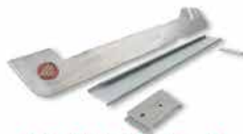
Pre-A Rocker Panels Fits 1950-1955 SMS-51-323 / SMS-51-324