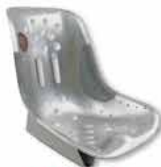
Speedster Aluminum Seats SMS-521-061-A Steel and Reutter Versions Available