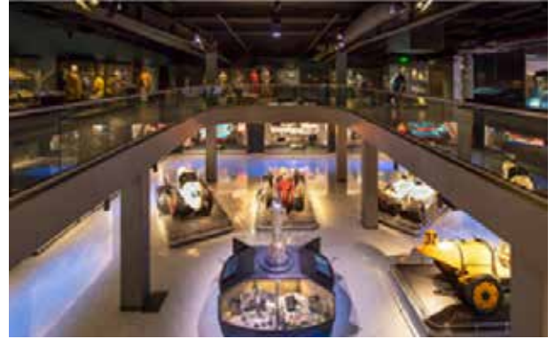
A grand new venue for the enthusiast

administrative offices and the other housed the display of about a dozen cars. The museum was a feast for my youthful eyes. Firstly, everything was in color! The books and magazines that I had devoured were all in black and white. The bright yellow of Ray Harroun's 1911 Momon Wasp replaced the vague shade of gray I had seen in the books. The deep burgundy of Wilber Shaw's 1939 and 1940 winning Maserati remains one of my favorites. Over the subsequent decades, a stop at the Museum has continued as one of the enduring annual traditions.