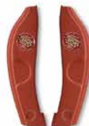
Concours-Quality Lockposts All Proper Impressions 356B T5 Shown