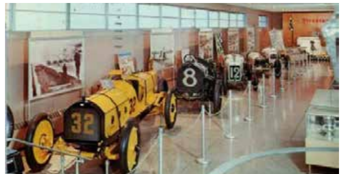
The first iteration of the Indianapolis Motor Speedway Museum in 1956

spectacular floats, bands, antique cars, and more. It was far more grandiose than my small-town Memorial Day parade with the school band and one firetruck.