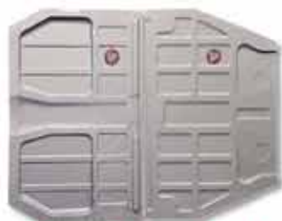
Proper Floor Panels 1950-52, 1952-55, T1, T2 and T5-C All Proper Impressions

Stoddard is proud to announce that we are the exclusive North American distributor of Simonsen 356 Panels.