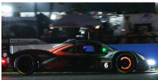
The second place Porsche 963 in the waning hours of the race hard on the brakes into the hairpin.

meet and converse with some of your favorite drivers. The event is also the opportunity to meet the famed "Sebring Cows" and the "Drunk Monks" among other costumed groups along the way. The track also provides a small museum with about a dozen different