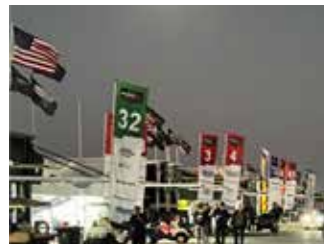
Fan transportation and camping, people watching, and the moonlight over the Sebring Paddock on race morning, bustling with activity.

For anyone attending the race, it is a must to walk through Green Park for night practice on Thursday or in the waning hours of the race on Saturday. The aroma of race exhaust with leaking oil coupled with steaks, hamburgers, and hot dogs on the grills blends with dust from the golf carts running up and down the dirt roads to lock into the memory bank the visual experience of glowing red brake rotors with the staccato sounds of super-fast downshifts from modern gearboxes and screaming race engines exiting the hairpin. Nothing quite like it in the US.