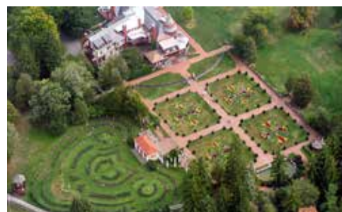
Sonnenberg House & Gardens