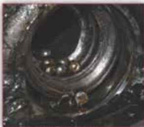
Catastrophic engine failure caused by IMS bearing failure