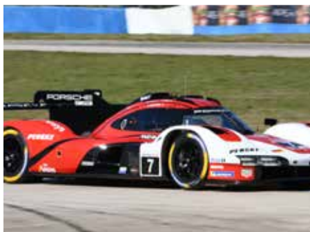
The winning Porsche 963 and Nick Tandy. Triple Crown of Endurance Racing and all with Porsche

teams took turns leading the field. Sincere congratulations to Nick Tandy particularly, as he joined a very elite group of 13 chauffeurs that have won the triple crown of endurance races of Sebring, Le Mans, and Daytona. It remains a remarkable feat, even though purists reflect upon the past glory days of only two drivers per car competing in these races, as a far greater test of driver endurance and accomplishment.