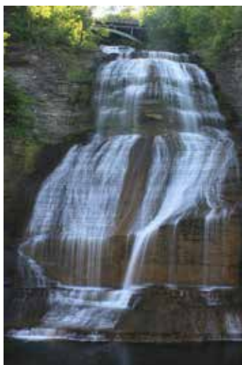
The scenic drive to the Curtiss Museum we will pass the Montour Falls.