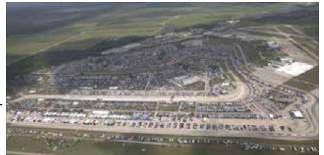
The "City" of Sebring International Raceway.

Although many of my age still "rough it" at Sebring in the old style. I am satisfied to simply resuscitate the fond memories of the past in my dreams, with an aging spine on a comfortable mattress, in my air conditioned rustic 1950's style motel, the Oak Tree Inn, just north of Sebring. Yes, my contemporaries who still camp have largely given up the old Army surplus pup tents that were a fixture in the 1960s and 70s at race infields, for every style of motorized camping vehicle, from opulent chalets to revamped ancient school buses. Other enthusiastic revelers even come with supplies to construct elaborate rustic structures with all the comforts of home, miniature grandstands, big tents with stages for music, and large screen TVs, with the drone of power generators humming in the background throughout the infamous Green Park (the prestigious and most fascinating camping area on the western end of the infield extending from the "Big Bend" after turn 5 through the turn 7 hairpin and north to turn 10-11).