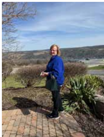
The view of Keuka Lake from Bully Hill Vineyards & Restaurant