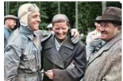
Elly Beinhorn (center) with Bernd Rosemeyer and Ferdinand Porsche

records, with Rosemeyer taking the laurels with a speed of 252.48 mph. Although great rivals on the track, Caracciola and Rosemeyer, had established a deep respect and friendship by this time.