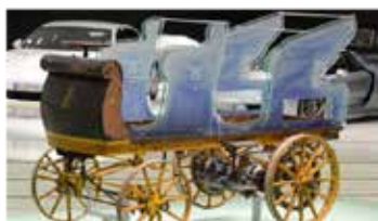
The first car designed by Ferdinand Porsche in 1898, the P1, was electric and discovered in a barn in 2013, and is now in the Porsche Museum in Stuttgart.

But first some necessary background. By the 1930's Ferdinand had been long recognized as a genius of automotive engineering, contributing to major advances early in the 20th century such as the very first electric vehicles, as well as hybrids, and piston-driven cars for companies such as Egger-Lohner, Austro-Daimler, and Daimler Motoren Gesellschaft, which later merged with Benz & Cie to form the Daimler-Benz Company, with their joint products called Mercedes-Benz. Ferdinand left the company due to the lack of enthusiasm of the Daimler-Benz board for his promotion of small, lightweight, Mercedes-Benz vehicles.