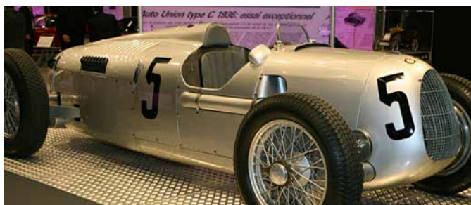
The Auto Union Type C, an audacious engineering feat, a V16 supercharged engine, which by 1936 grew to 6-liters, producing 520 bhp, allowing speeds of well over 200 MPH.

But race cars need race drivers, and Hans Stuck, who had been disregarded by Mercedes, became a principal chauffeur of the new Grand Prix Auto Union in 1935 and winning the team's first Grand Prix victory at Monza Italy later that year. Curiously, in late 1935 Auto Union enlisted a young motorcycle racing prodigy, essentially with no experience in car racing, Bernd Rosemeyer, onto the team. Rosemeyer's father owned an auto and motorcycle garage and repair shop providing Bernd with a mechanical acumen that pleased Professor