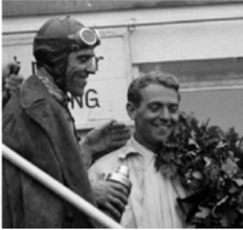
Nuvolari and Rosemeyer

Porsche and the Auto Union mechanics. He immediately proved fearless at the wheel of the loose handling (oversteering) and demanding Auto Union but quickly adapted to the new sport. Indeed, Bernd won his first race, the non-championship Grand Prix of Masaryk (Czechoslovakia) a full 6 minutes ahead of Tazio Nuvolari, perhaps the greatest driver at the era, in the Scuderia Ferrari Alfa Romeo.