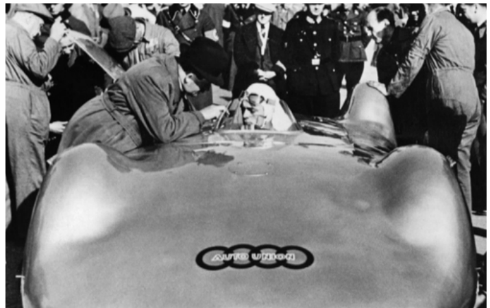
Ferdinand Porsche leans over the Auto Union streamliner to converse with Bernd as he sets off on a land speed record attempt.

After the 1937 season's dust had settled, Mercedes and Auto Union, continued their rivalry with updated streamliners in late January, before moving on to the spring testing of the new Grand Prix cars. Competing on the Frankfurt and Darmstadt autobahn, early in the morning of a chilly overcast day, Rudolf Caracciola was first out. The revised streamliner (currently on display in the Frankfurt Mercedes Museum) completed a two-way run averaging 269 mph, establishing a new 1-mile speed record.